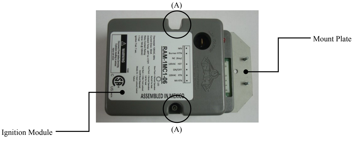
Ignition Module Assembly