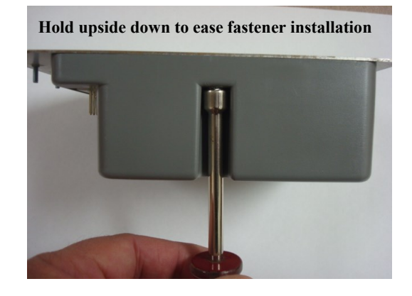
Replace mount screw